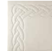
Celtic Knot Carved