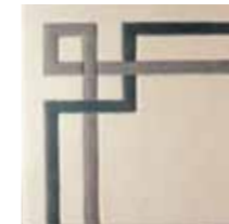
Line and Corner Inlaid