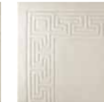
Greek Key Carved