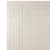
Line and Corner Carved