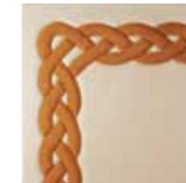
Celtic Knot Inlaid